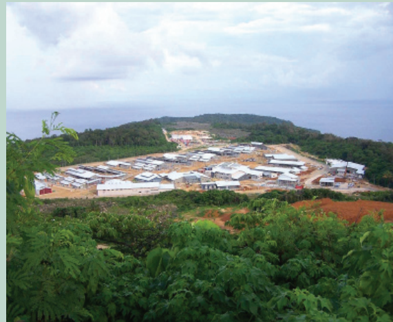
Distant view of Australia's $500 000 000 Christmas Island Immigration Detention Centre

Through friendship, support and community together we can bring dignity and meaning to these peoples lives.